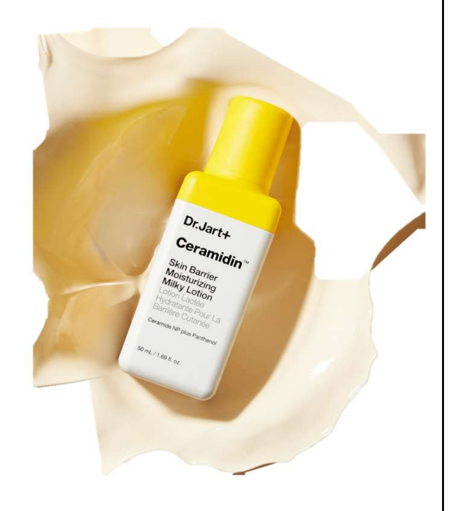
Suggested retail price: 50ml - €39

The new Dr.Jart+ Ceramidin Milky Loticn™ will be available from mid-September 2024 at Douglas and douglas.nl